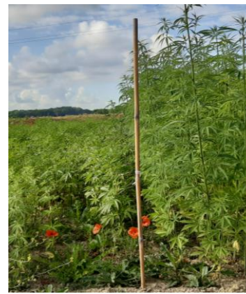
Figure 3. Different height in topped (left) and untopped (right) Futura 75, 78 DAS.