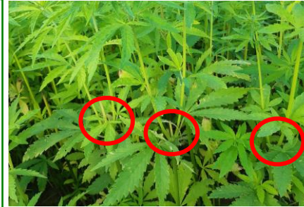
Figure 1. Lateral branches produced by Carmagnola topped plants at 72 DAS

Hemp is a versatile crop, from which a wide spectrum of agro-industrial products, such as textiles, bio-composites, pharmaceuticals, cosmetics and functional foods, can be obtained. Despite significant progress have been made on chemical and nutraceutical characterization of hemp products, the agronomic management practices for seed production remains insufficiently investigated. So, the aim of this work was to assess the effects of topping and harvest time on seed yield and cannabidiol content and composition of threshing residues in two hemp varieties.